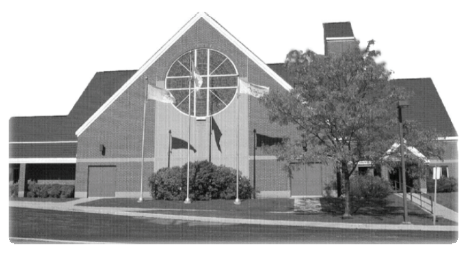
"... The seed is sprouting and growing ..." (Mark 4:27)

White Box Collection on the last Sunday of the month. Call 519-571-8485 for information on food distribution.